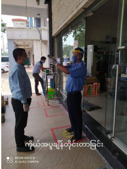
Fig: Body Temperature Inspection