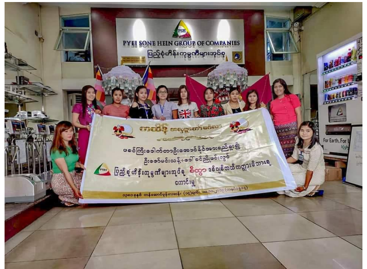
Fig: Team Donation at Monastery