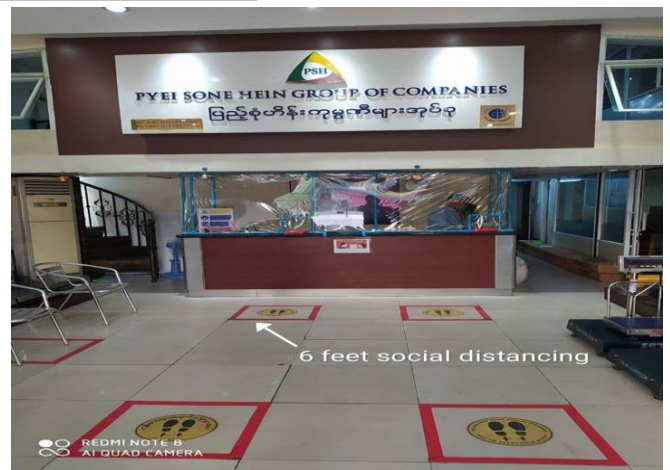
Fig: Implemented Social Distancing