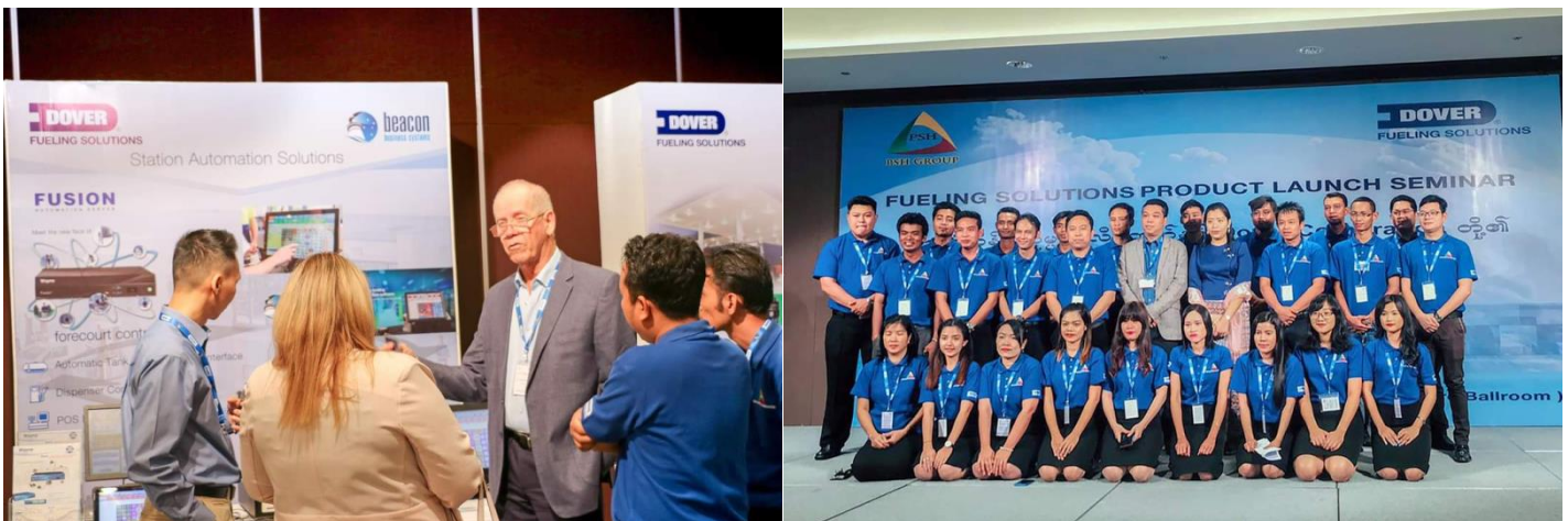
Figure: Bring Global Innovative technologies to local (New Product Launching)

During 2018-2019, Company provides internal and external training to our employee and builds up their individual skill as well as team work. Also build up skill with new innovative global technologies.