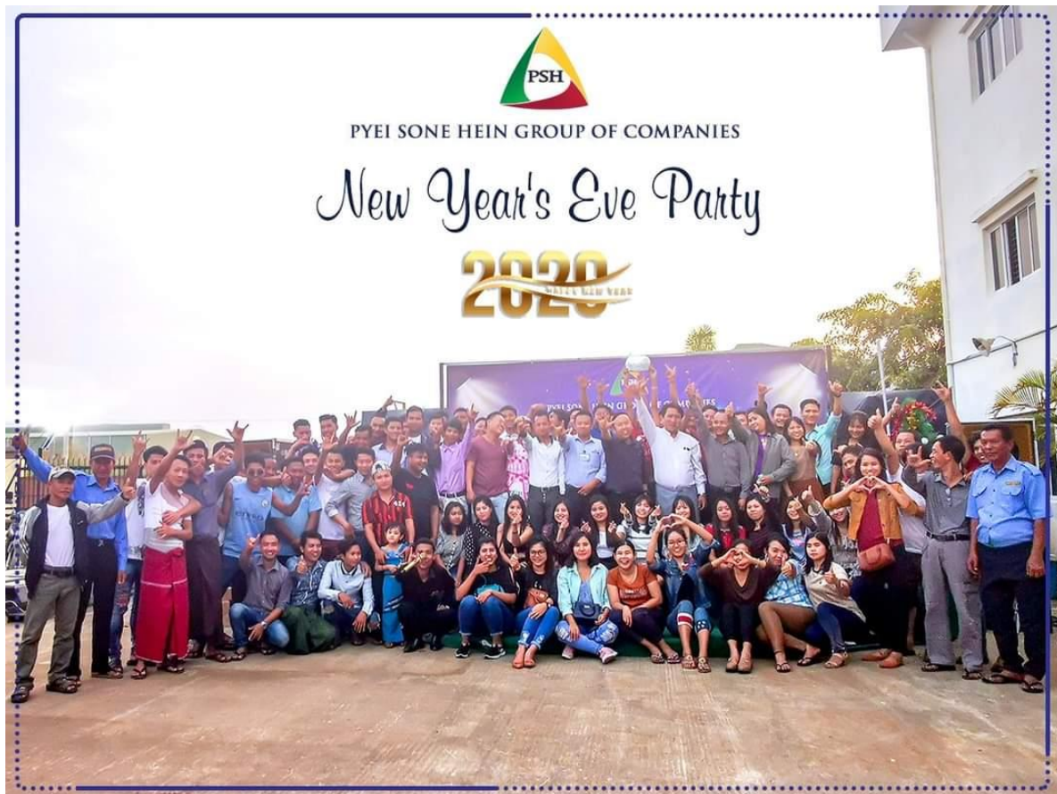
Fig: PSH Annual Staff Party & Team Building Activities