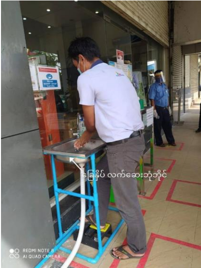
Fig: Hands wash