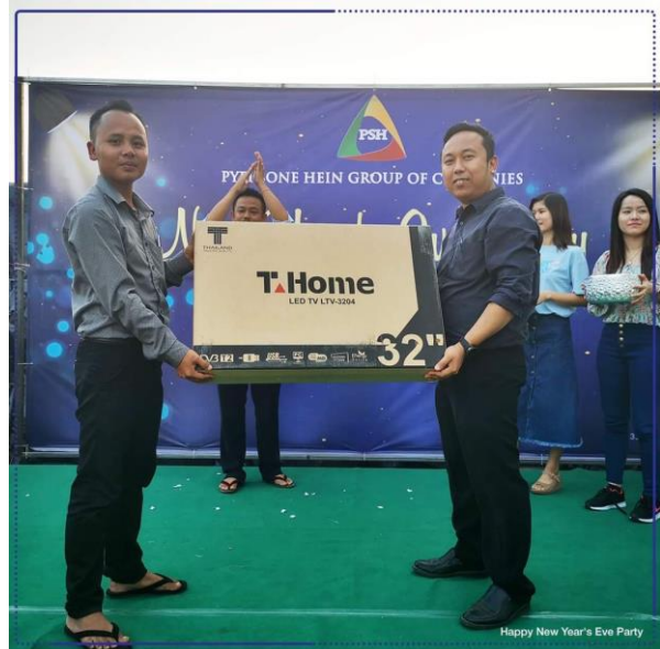
Staff Team building program